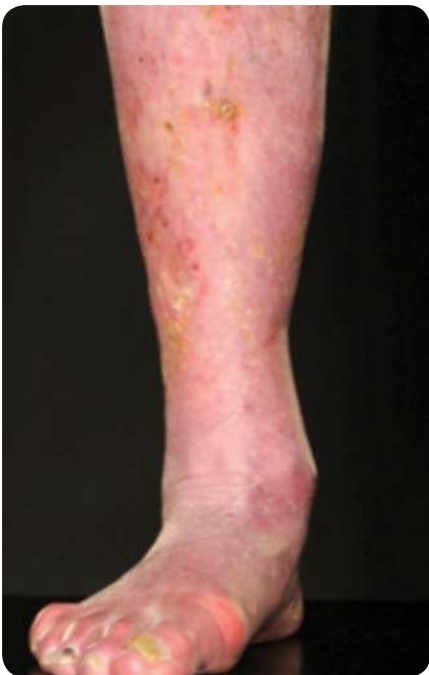
Figure 4. Fully healed after eight weeks of treatment.

in the author's clinical experience, foam dressings provide the perfect balance between fluid-handling capabilities and maintaining moist wound healing.