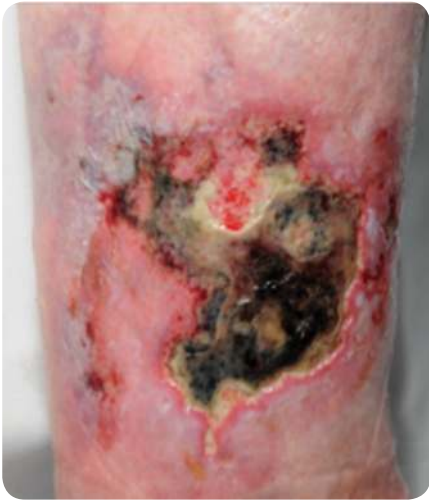
Figure 2. Ulcer at presentation.