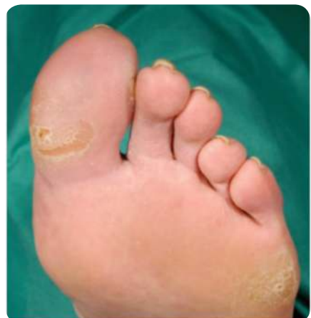
Figure 7. Complete healing after three weeks of treatment.

at dressing change, thereby ensuring that the surrounding fragile skin and newly-formed granulation tissue is protected.