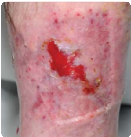
Figure 3. Mr W's ulcer at four weeks since referral.