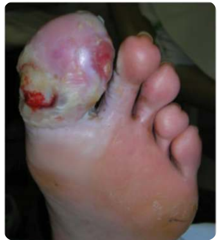
Figure 6. 48 hours after treatment with Advazorb.